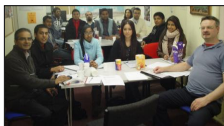
Cambridge Mauritius Society attending CECFs "Beyond Survival Training"

Cambridge Mauritius Society members participated in CECFs "Beyond Survival" training programme. It was particularly encouraging to see their youth committee fully involved. 15 of their members attended a training session at CECF on Friday the 26 th of November. More information about the Cambridge Mauritius Society can be obtained from their Website at www.cmsociety.org.uk .