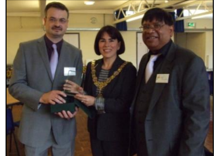
Local Hero Award handed over at the CRISP Launch (see p.2) which coincided with "Residents Day 2010" (l-r):

The Voluntary Sector is going through one of the biggest upheavals that it has experienced in recent years. The political landscape is changing, many organisations are facing funding issues, much has been said about the 'Big Society' and how important the role of volunteers will be. For those of us that are working in the community sector we already know how important volunteers are. The work of the Cambridge Ethnic Community Forum (CECF) would not be possible without them. In this regard the volunteers of CECF recently won a Local Heroes award in recognition of their tireless work for minorities in Cambridge over the years. This was presented by the Cambridge City Council at 'Residents Day 2010'. I would like to take this opportunity to thank all of the volunteers of CECF that have given their time to support us. Their commitment, energy and enthusiasm has been fantastic.